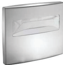
SEAT COVER DISPENSERS