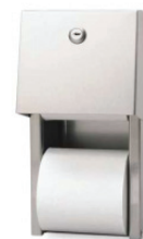
TOILET PAPER DISPENSERS